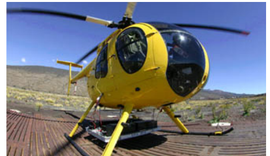
CLASS™ Mounted on a Hughes 500 Helicopter for UXO Range Surveys

US Army Pahakuloa Training Area, Hawaii – CLASS™ used to perform aerial surveys over a total of 936 acres on an active firing range with UXO and other worker hazards (lava fields). Hazardous conditions prevented performance of traditional walkover surveys. Targets were depleted uranium, Davy Crockett Spotter Rounds (DCSR), and debris from the weapons system. By focusing on the range of the weapon (1 to 2 km), CABRERA was able to narrow the survey area. A laser rangefinder was used to control flight elevation to maintain consistent system detection limits and aerial surveys provided confidence that only a small portion of range was impacted by DCSR usage.